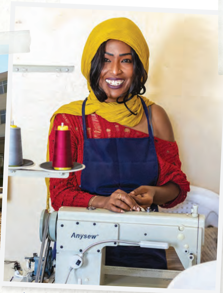
A young girl you are helping through Mercy Chapel