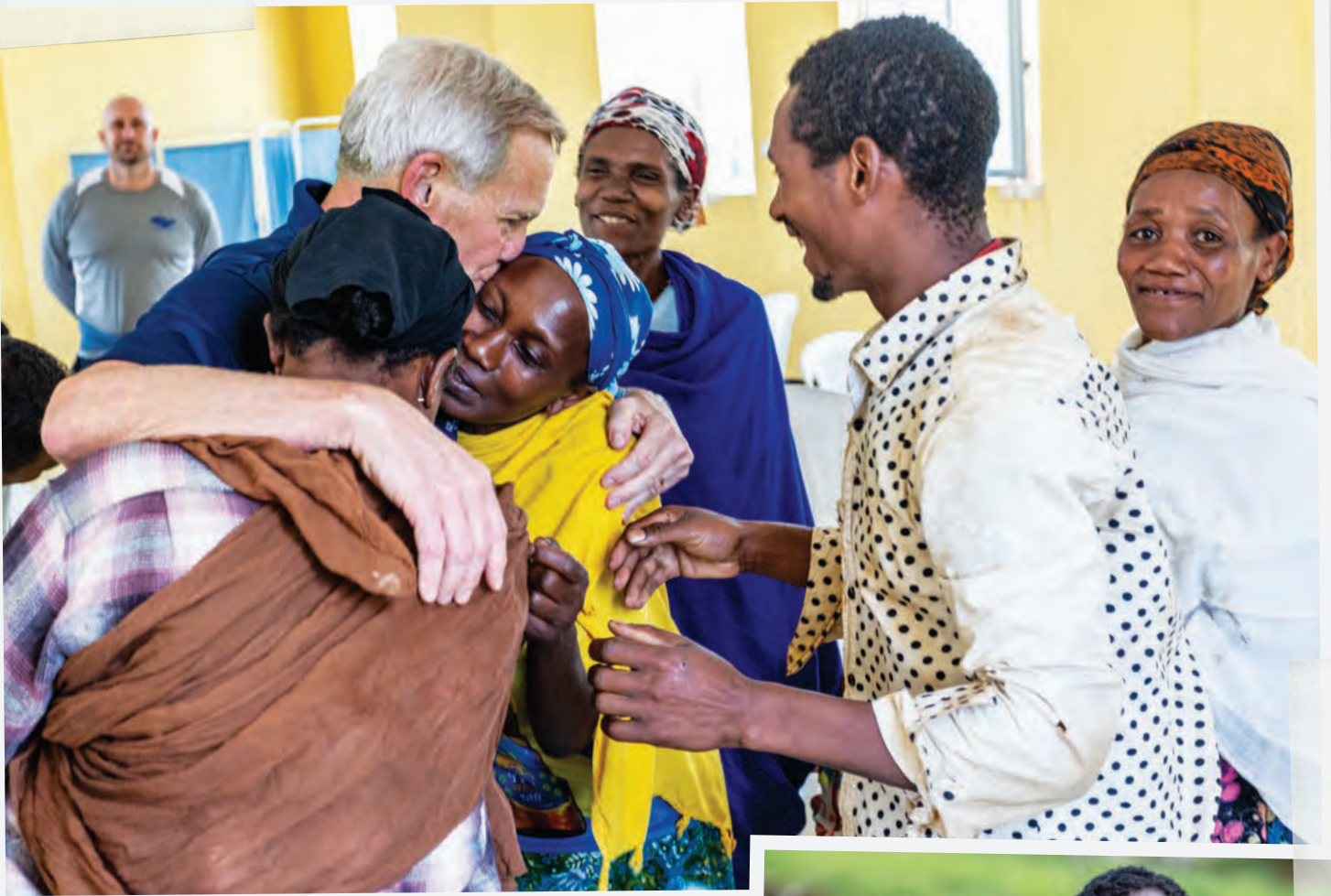
A family you are helping