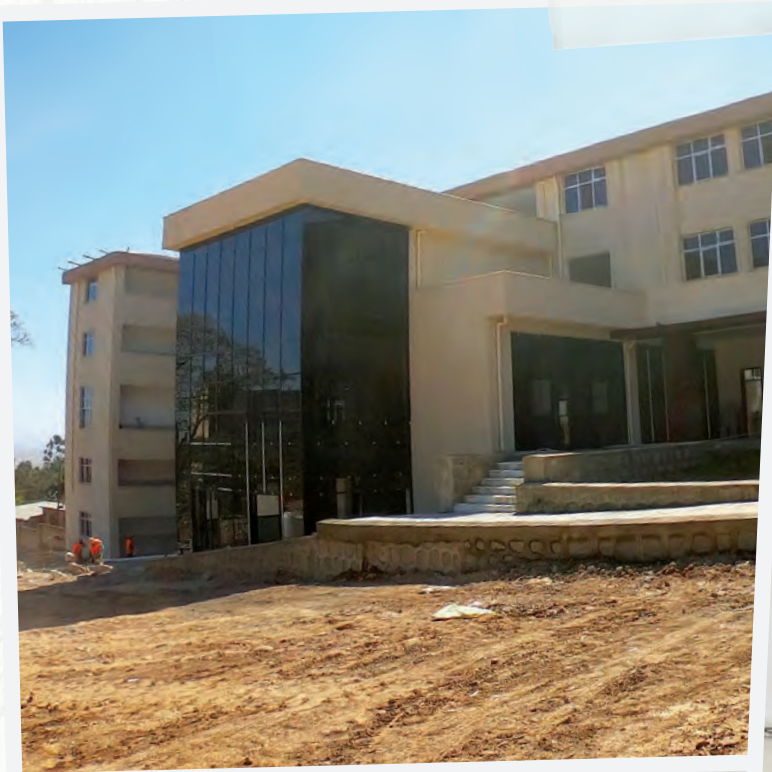
Future Refuge Home for 100 girls and their children

We are simply the trusted temporary custodians of the change you want to see in the world: a change from hopelessness to hope, and from despair to joy.