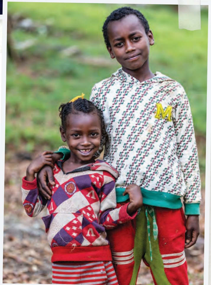
Two very happy children you have helped