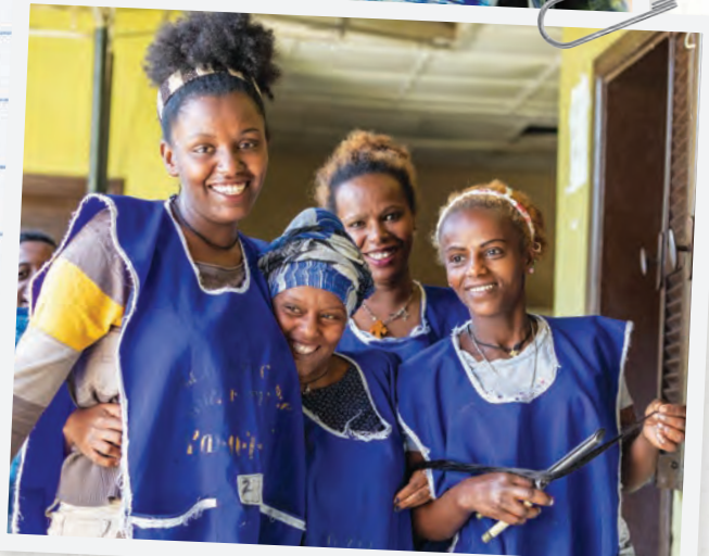
A few of the girls at Mercy Chapel