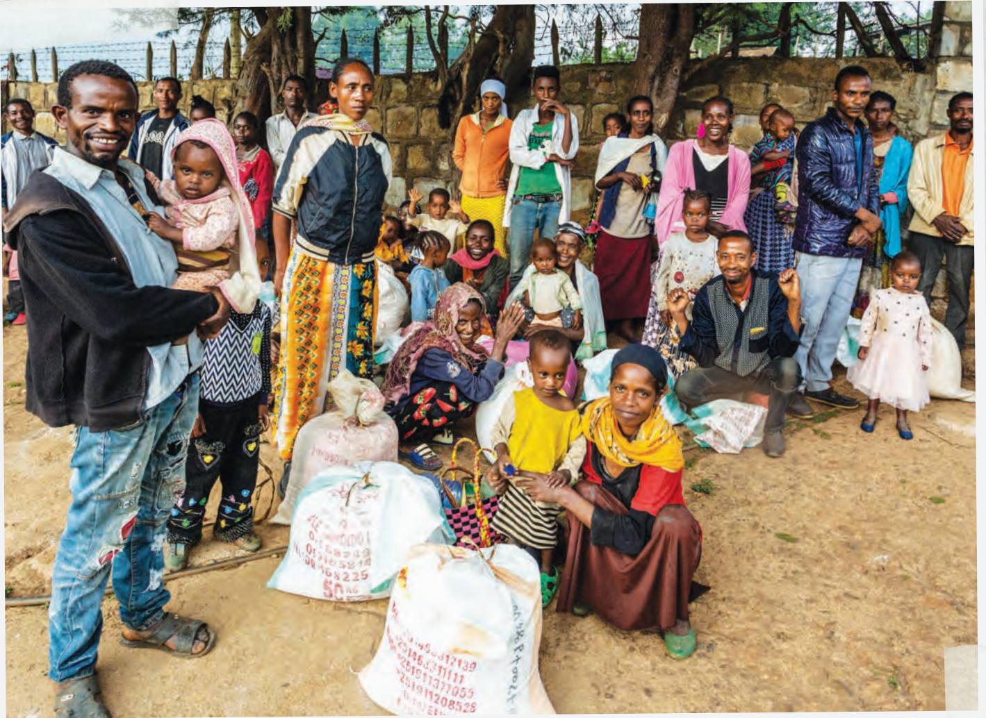
Families receiving food you provided